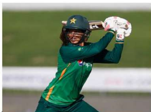
Aliya Riaz of Pakistan Women during game two of the 2021 Women's ODI Series against South Africa

As part of their preparations for the upcoming global events, Pakistan women will tour the West Indies. The national side will play three T20Is and five ODIs. Pakistan Women 'A', who will also be on the tour, will play three 50-over matches and as many T20s against West Indies 'A'. Later in the year, Pakistan are expected to feature in a couple of bilateral series before proceeding for the World Cup qualifiers. They are also expected to feature in an Asian event at the backend of 2021.