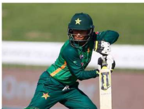
Nida Dar of Pakistan Women during game two of the 2021 Women's ODI Series against South Africa