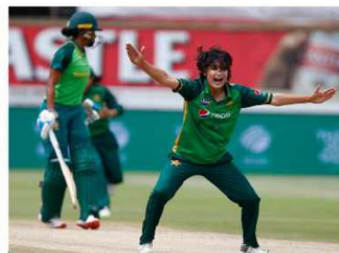
Diana Baig of Pakistan Women during game one of the 2021 Women's ODI Series against South Africa